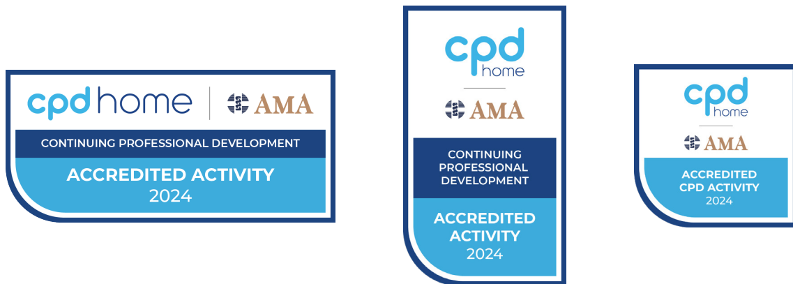
Figure 2: CPD Home Accredited CPD Activity 2024 logo

Will display the CPD Home Accredited Activity logo stating the year the learning is accredited for.