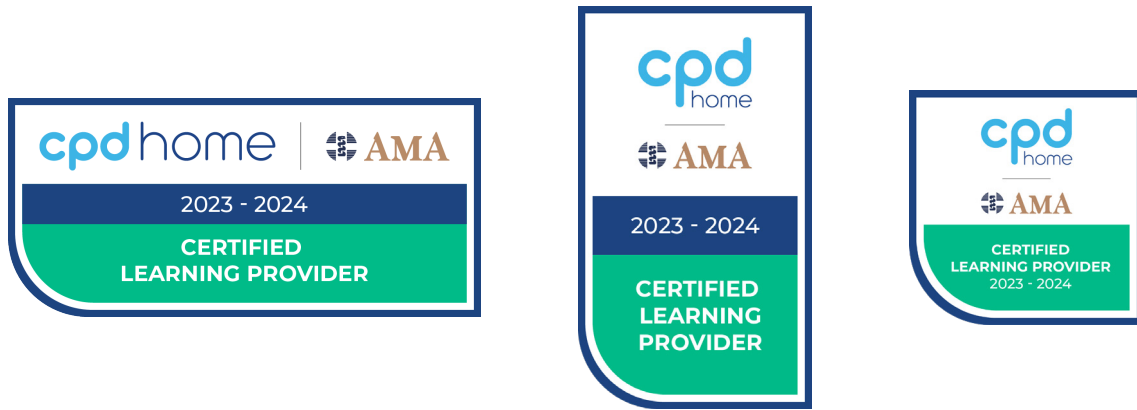
Figure 1: CPD Home Certified Learning Provider 2024 logo

May display this logo for the approved period.