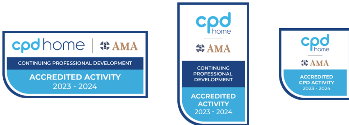
Figure 2: CPD Home Accredited CPD Activity 2023 - 2024 logo

Will display the CPD Home Accredited Activity logo stating the year the CPD activity is accredited for.