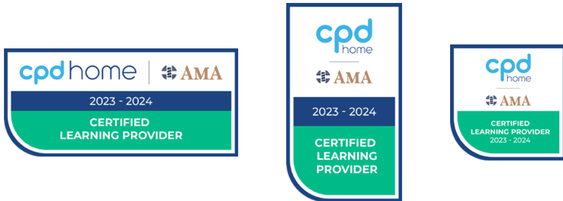
Figure 1: CPD Home Certified Learning Provider 2023 - 2024 logo

May display this logo for the approved period.